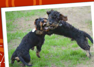
COCO & DINO --- THE BLUES BROTHERS AT PLAY